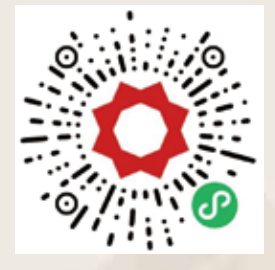
Scan the QR code in WeChat or search "中駿集團投資者關係小程序" (China SCE Investor Relations Mini Program) on WeChat bulletin board for the Group's latest development

Scan this QR Code or search "SCE1966HK" in WeChat for the latest Company information